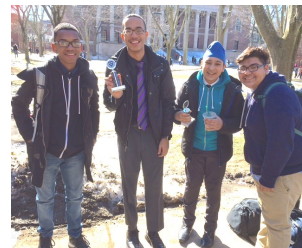
Pictured above, the NYCUDL team following the winning double octo finals!