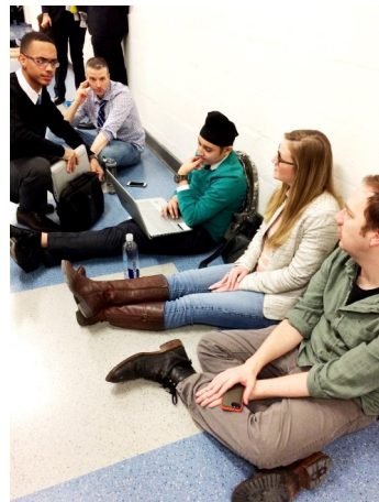
Pictured here, the team preparing for the next round.