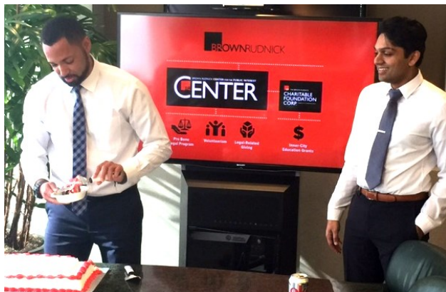
Pictured here, a celebratory cake!