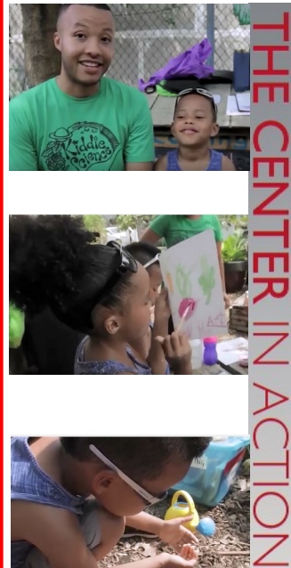
Photos of Community Grantee Kiddie Science

All year the Brown Rudnick Charitable Foundation seeks applications for educational grants to support inner-city educators through its Community Grant Program. Created to support front-line educators who often do not have a voice in funding decisions, the Community Grants subsidize small, concrete projects, which will improve inner-city education within Boston; Hartford; London; Providence; New York; Washington, DC, or Orange County, California within the coming year. The grant applications and an explanation of the program can be found HERE .