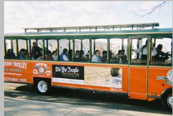
The US Capitol Historical Society's We the People Tour.

As a DC Public School teacher for the past six years, I'm always looking for opportunities to enhance my students' learning and expose them to new experiences. We the People Constitution Tour accomplished that and so much more. This tour allowed my 8th students an opportunity to visit the Department of Agriculture, the Supreme Court, the White House, the Lincoln Memorial, and the Capitol. The tour was convenient; it picked us up at my school, dropped us off, included lunch AND came with a tour guide who was entertaining and informative. My students had been studying the Constitution and the Bill of Rights, but it wasn't until we took the tour did the document really come alive for them. The information gained on the tour plus the new experiences (i.e. seeing the Constitution for the first time ever) was irreplaceable. I hope that all students are granted enriching opportunities such as this.