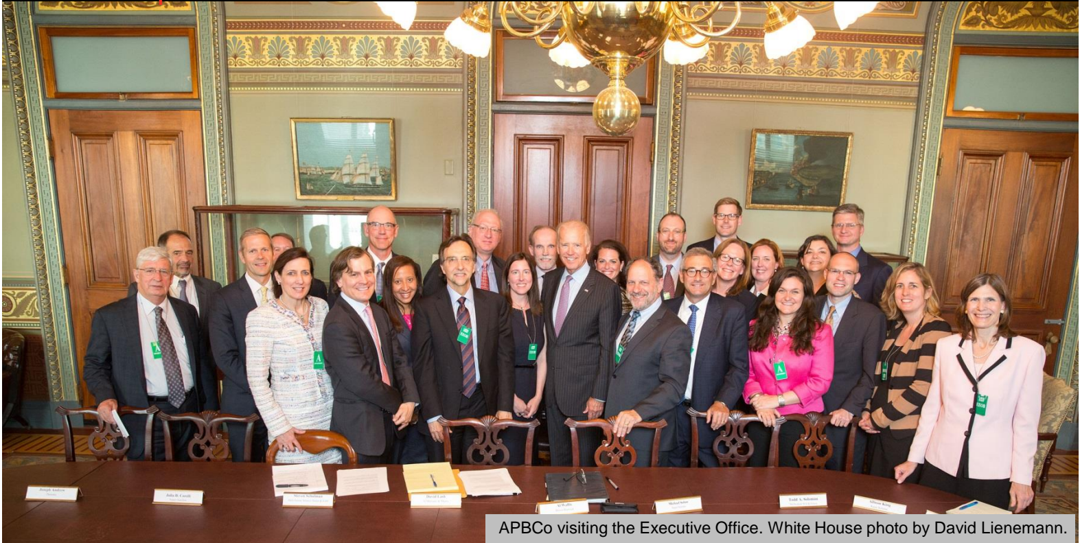
APBCo visiting the Executive Office.