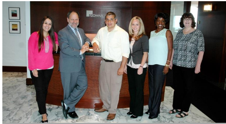
The Village for Families and Children visits the Brown Rudnick Hartford office.

The firm's London office recently hosted current Relationship Grantee, LIFEbeat in an interactive learning experience between Brown Rudnick staff and attorneys and LIFEbeat youth participants. LIFEbeat provides transformational learning experiences for disadvantaged London teens. The grant is used to support mentoring and 2014 summer camps.