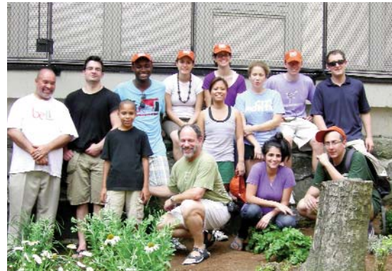
July, 2010 - BELL - NY