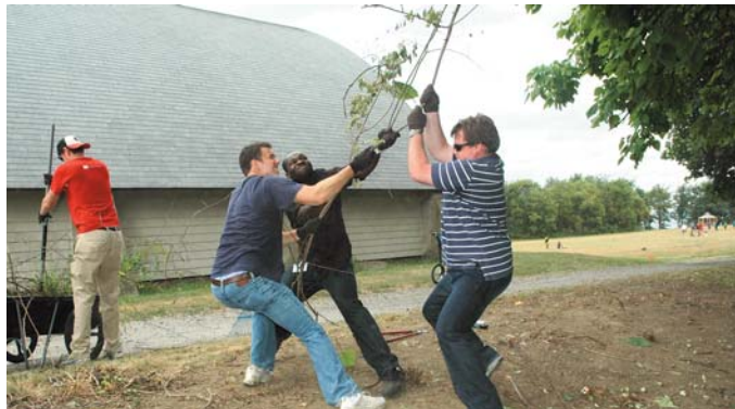
July, 2010 - Thompson Island/Outward Bound - Boston