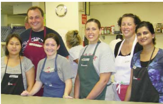
July, 2010 - Rosie's Place - Boston