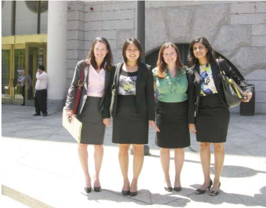
July, 2010 - BHCT Attorney for the Day

The Center program for Brown Rudnick's Summer Associates kicked off in June in Boston and New York City. The "summers" were engaged in: