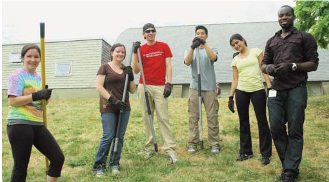
July, 2010 - Thompson Island/Outward Bound - Boston