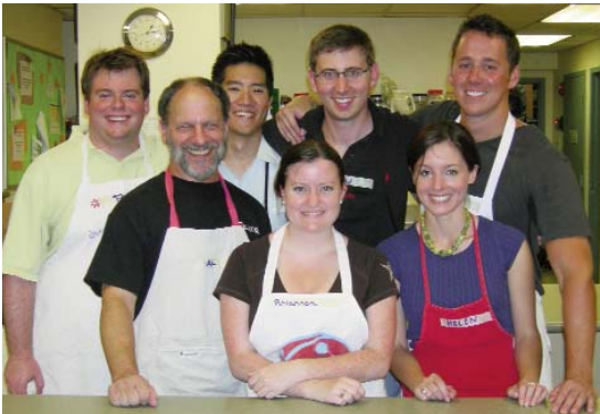
July, 2010 - Rosie's Place - Boston

A visit to Rosie's Place - a shelter for women - to prepare and serve lunch.