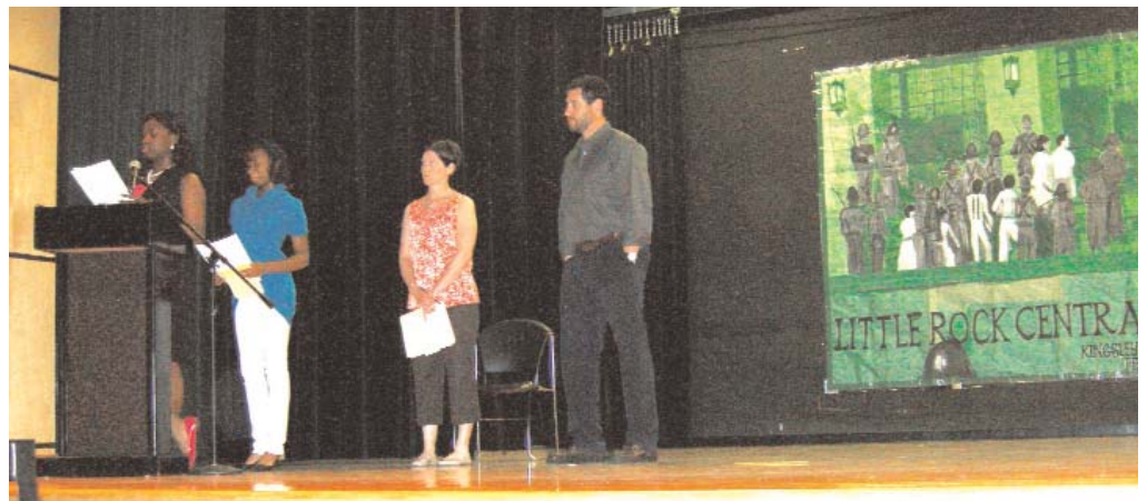
Essay Winners, Facing History Program

As part of a Foundation Relationship Grant awarded to Facing History and Ourselves , the organization brought Dr. Terrance Roberts, one of the original group integrating Arkansas public schools in 1957, to an assembly in the Mildred Middle School in Boston. Winners of the Brown Rudnick Charitable Foundation student essay contest (“What Little Rock means to me”) were recognized and Dr. Roberts spoke with the teachers and students about his experiences as one of the “Little Rock Nine”.