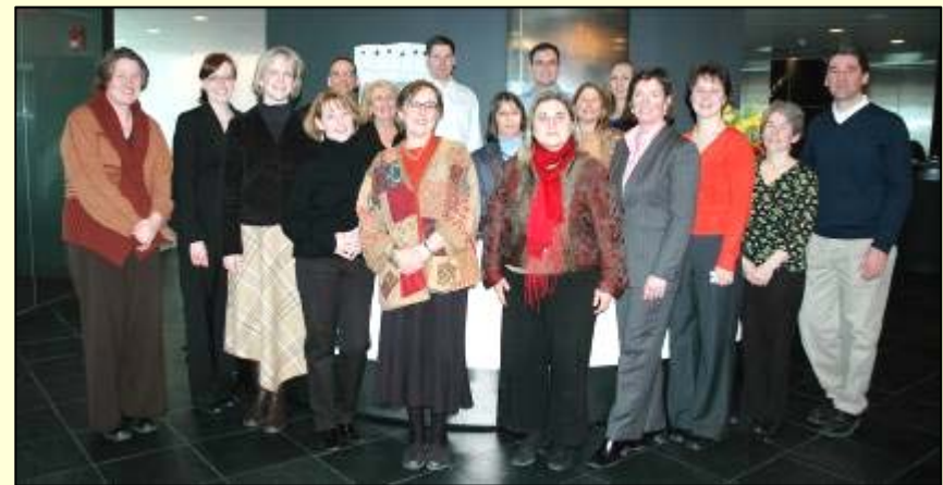
Recipients of 2006 Relationship Grants in Boston meet with "grant champions" and staff at Brown Rudnick's Boston office.