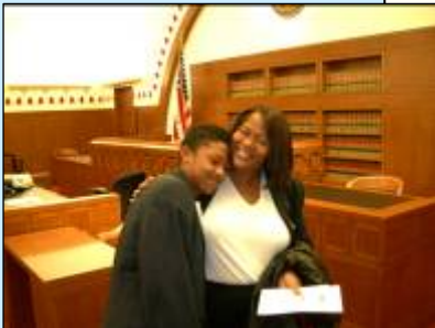
A proud parent.

A 2006 Foundation Relationship Grant to Citizens Schools and Discovering Justice supported the Boston mock trial program these organizations coordinate with participating law firms, middle school students and the court.