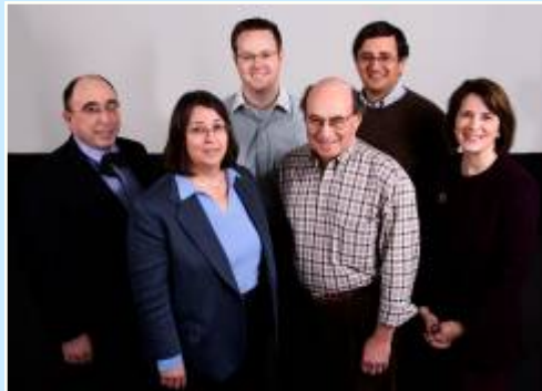
Brown Rudnick is Pro Bono General Counsel to Facing History & Ourselves.